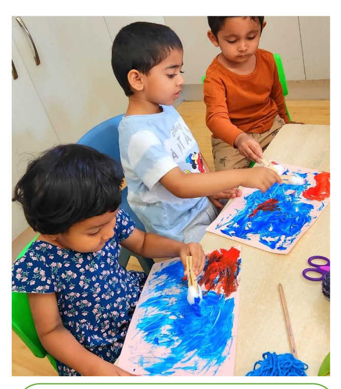
Our children have been participating in our project-based learning experiences, "Exploring Australia". The goals of this project are to encourage children to develop a strong sense of belonging and identity as an Australian.