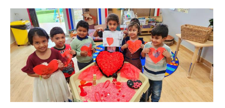
Our Children Celebrated Valentine's Day on 14<sup>th</sup> February,2023